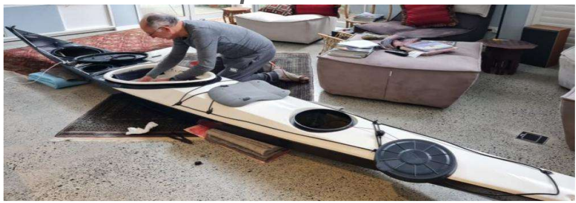
Maintenance in Level 4

These past couple of months have certainly been eventful and challenging. Understandably the delta strain of Covid has been an irritation and restrictive, but what has been more unusual for this time of year has been the weather patterns and rough seas which have been more of a surprise and kept even the experienced paddler off the water.