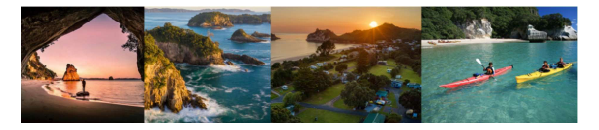
KASK Kayak Fest 2022 at Hahei on the East Coromandel Coast Thu 10th to Sun 13th Feb

For further details and to register, please visit.